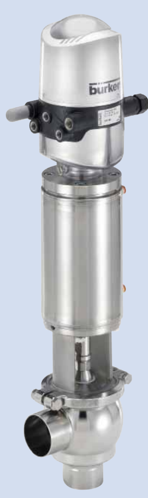
Hygienic Process valves decentrally automated