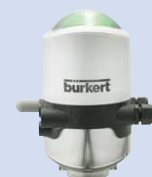
Control Head 8681 with coloured status indication